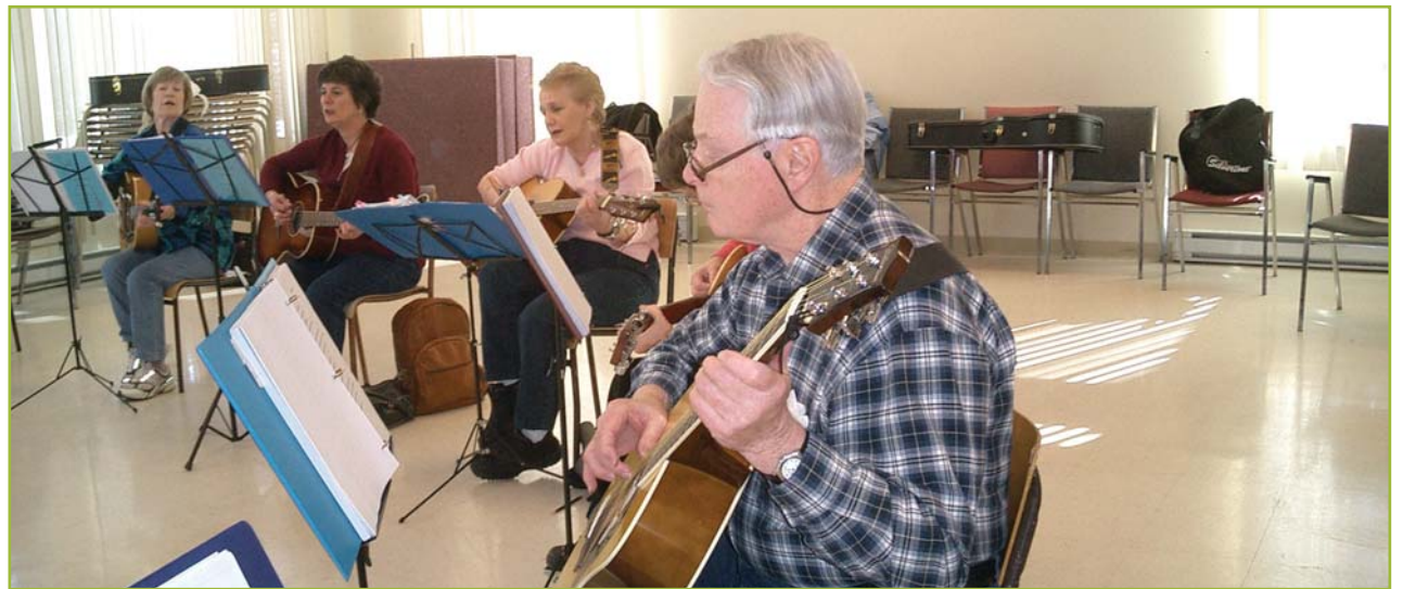
Members of the Senior Citizens Club on Bennett Avenue, St. John's, perform "Music and Friends."

The study will determine the existing and emergent housing needs and options for our region's aging population.